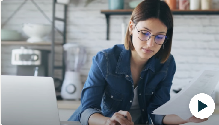
Making it easier to grow accounting revenue (2:25)

Get your clients up and running easier on QuickBooks Online with improved migration assistance and support.